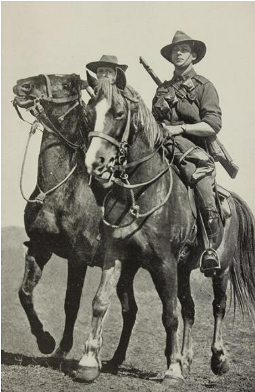
Men of the 1 Light Horse Brigade before departure from Australia, Official History of Australia and the War, Vol. 12, Charles Bean, plate 42

The New South Wales Lancers went under a number of different names before the outbreak of World War One and because some of these names are easily confused with the names of other Regiments I thought it would be good to clarify a little of this history before telling their story.